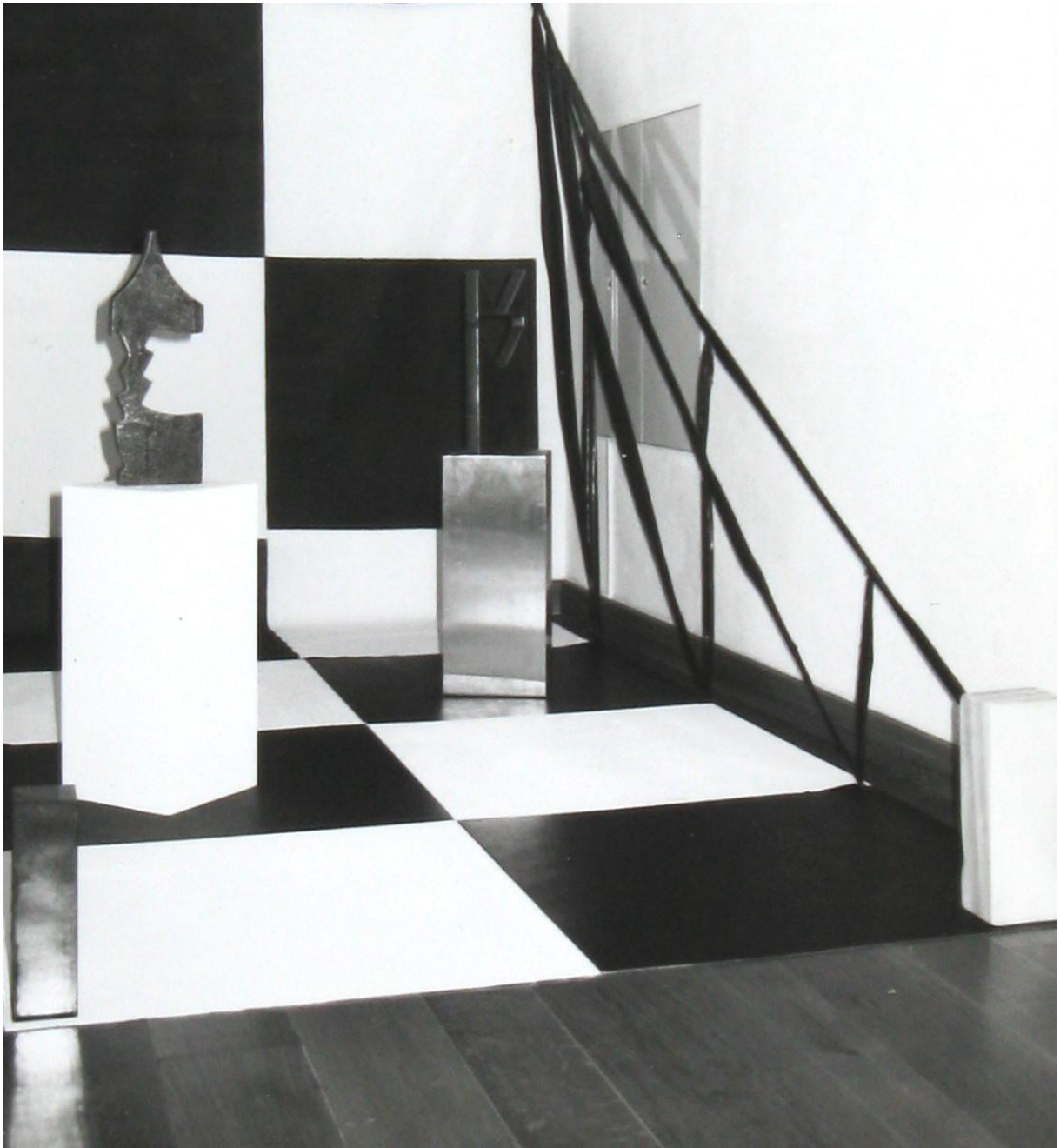
Installation art in the castle of Reinbek next to Hamburg in 1992