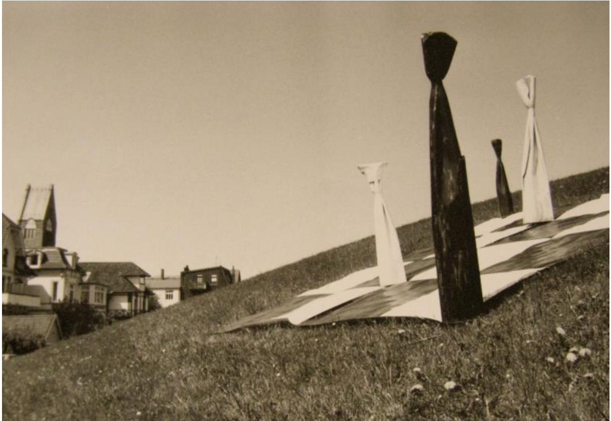
Chessmen on the dyke near the town of Cuxhaven.