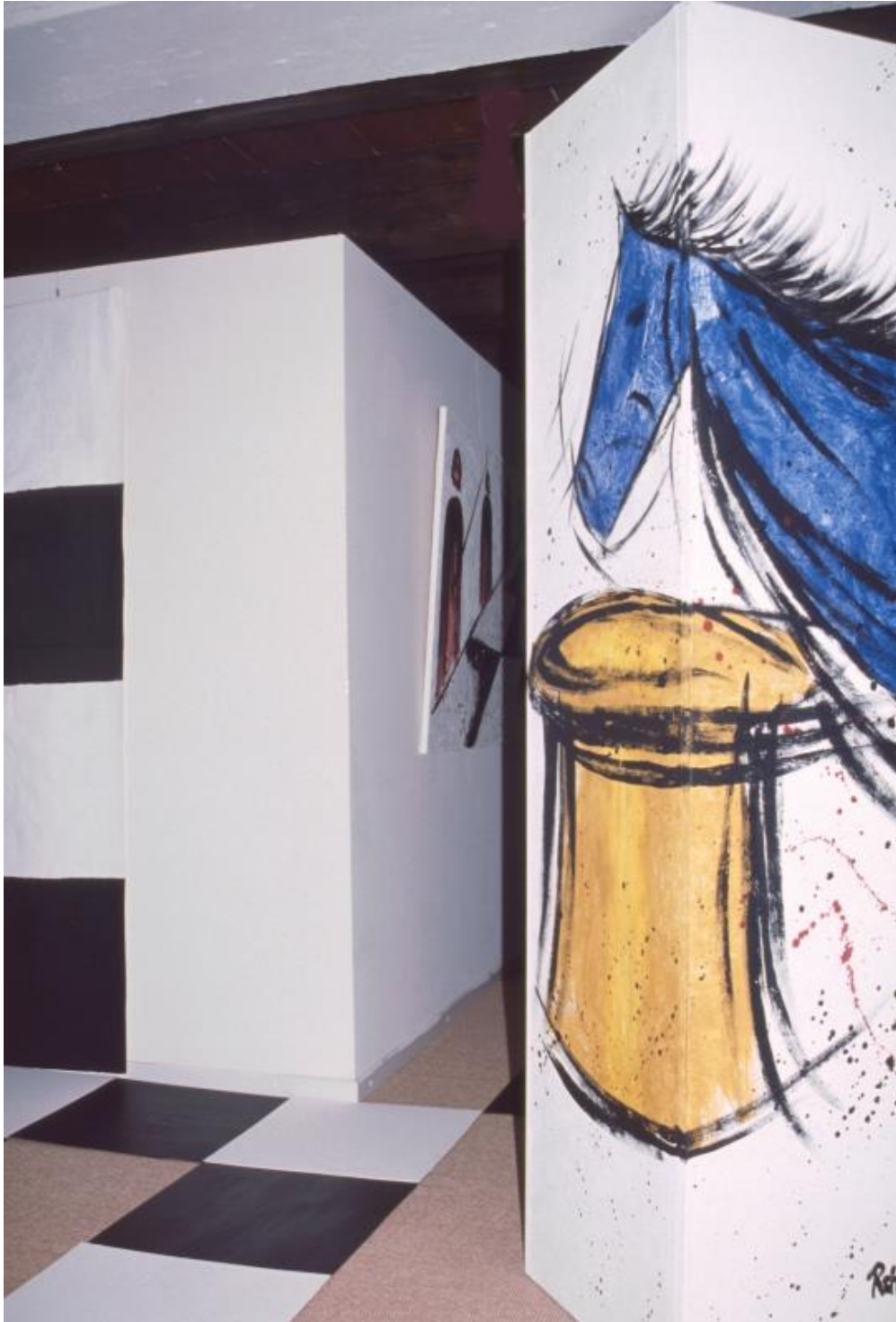
Detail of the Installation Art by Elke Rehder in the Federal Academy of Cultural Education in Wolfenbüttel 1992