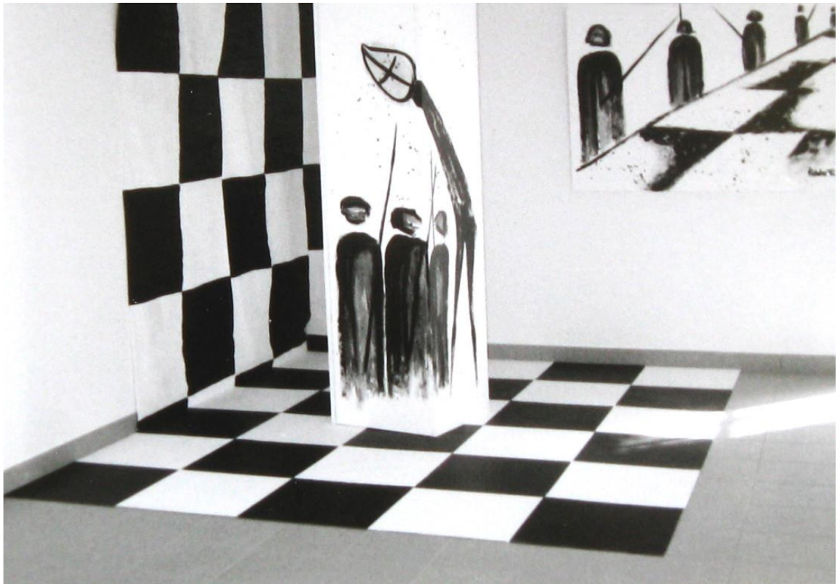
Chess installation at the gallery "Art und Weise" in Heide / Holstein 1993