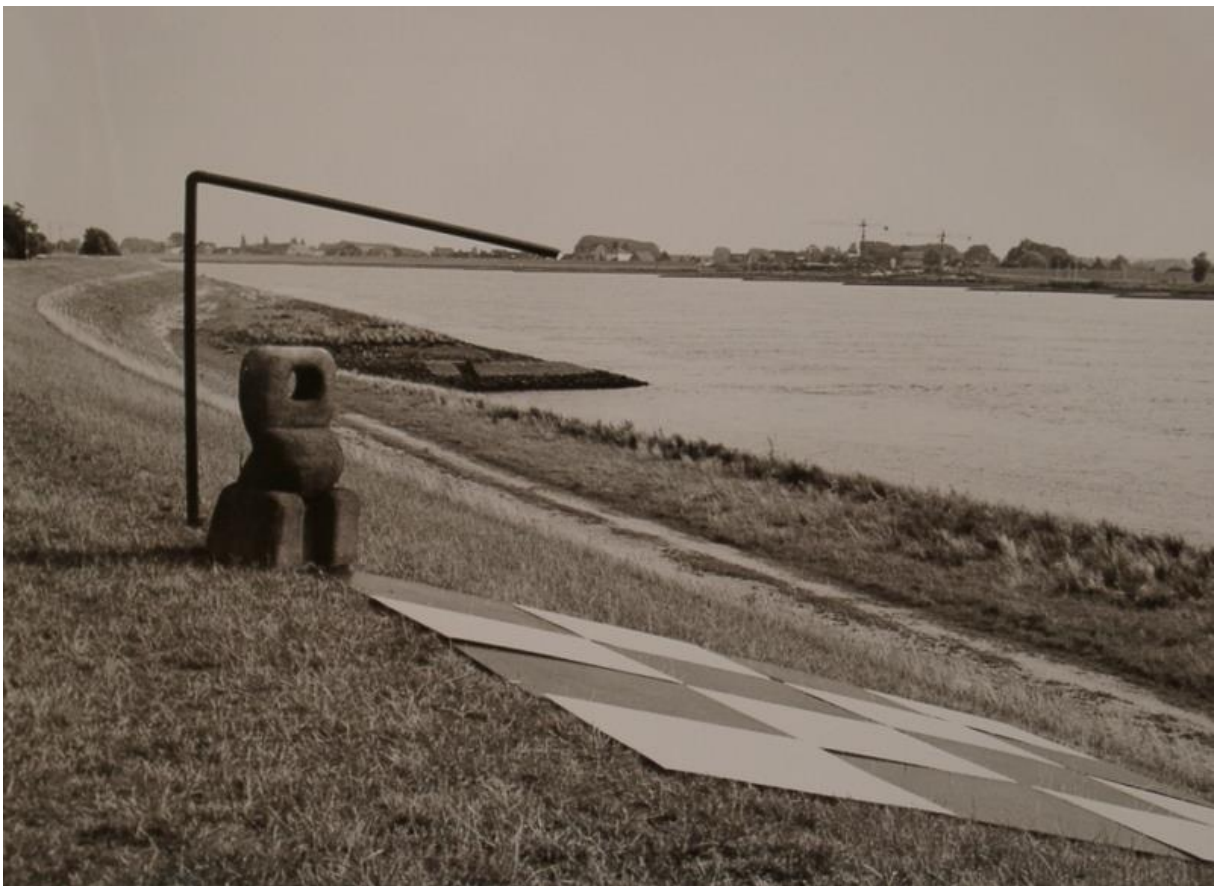
Steel boom, granite stone and wooden panels on the banks of the river Elbe.