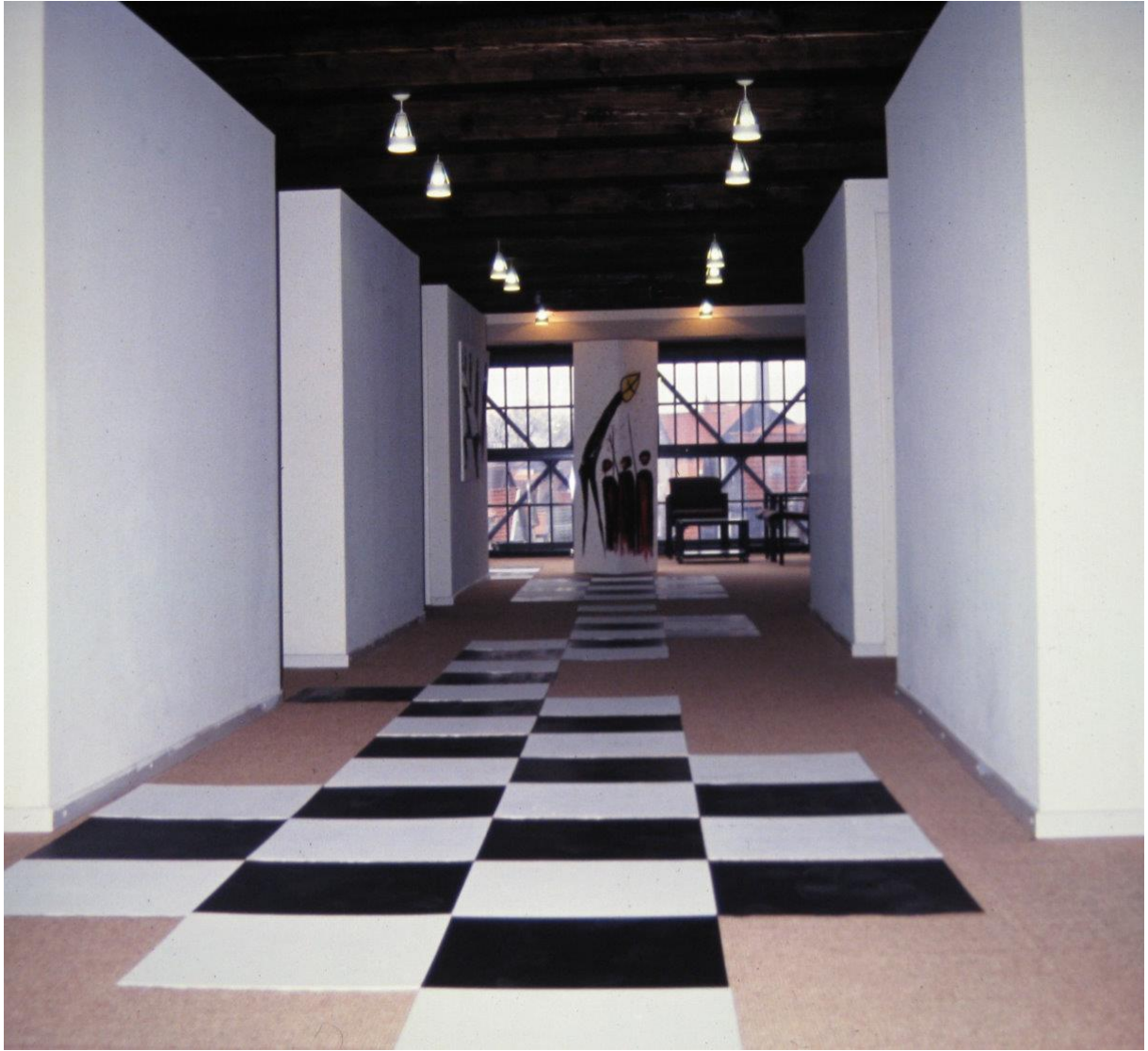
Chess Installation in Wolfenbüttel 1992