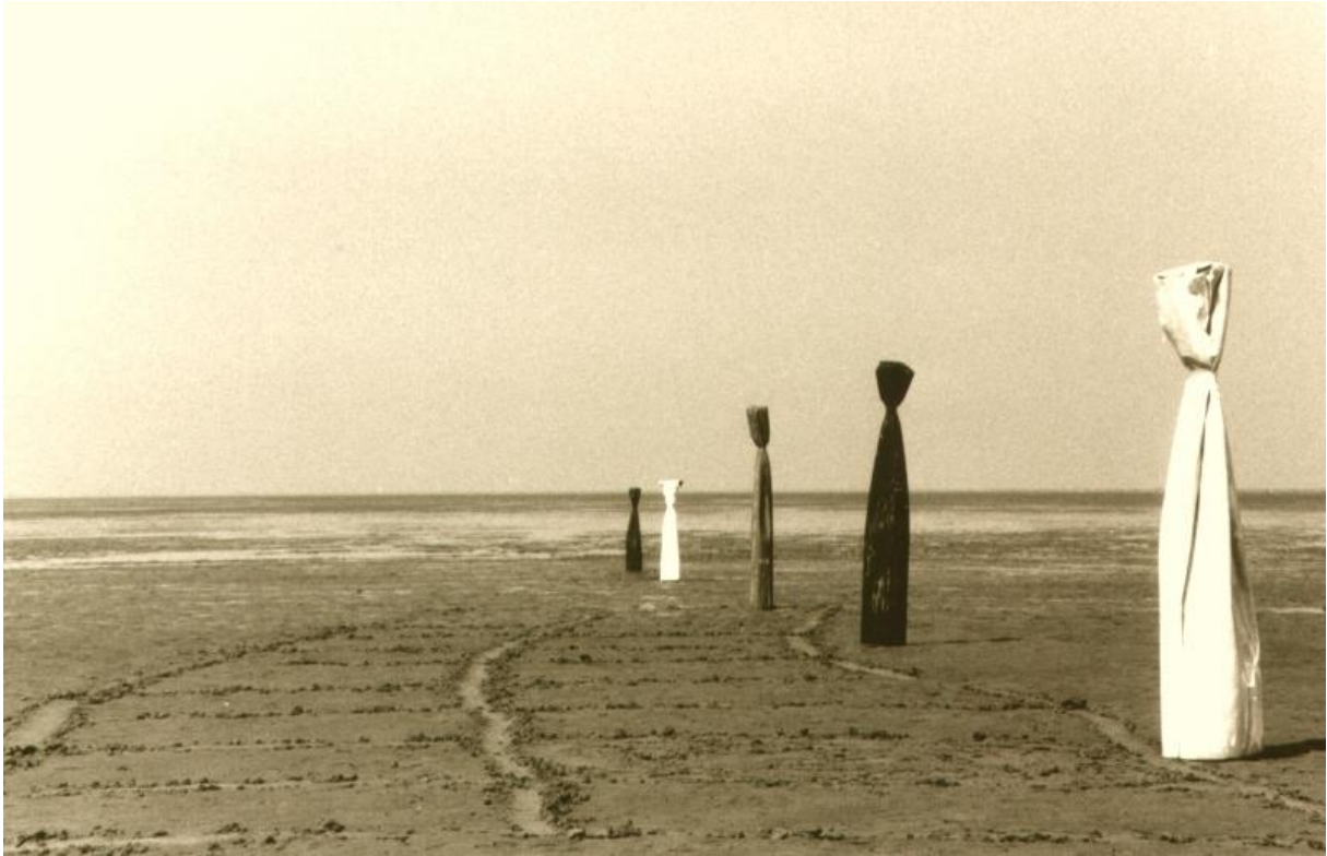
Chessmen on the mudflat in the North Sea.