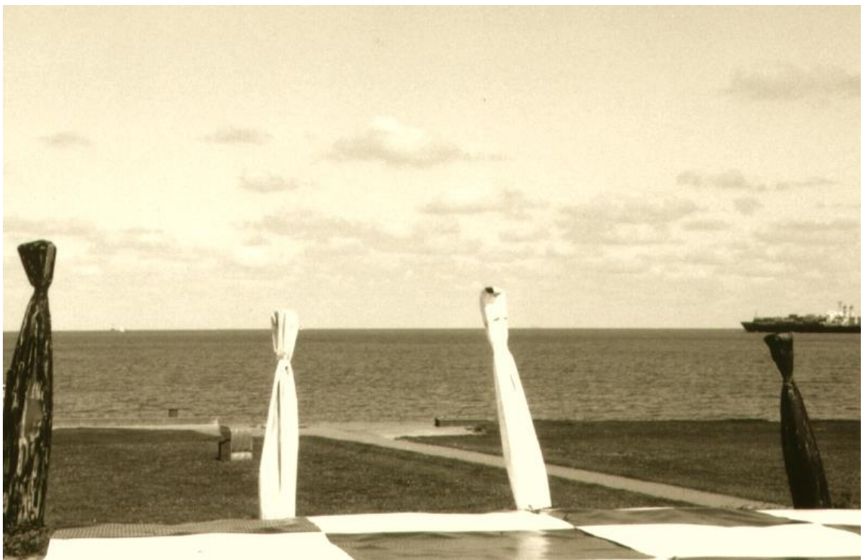
Chessmen look on the mouth of the river Elbe.