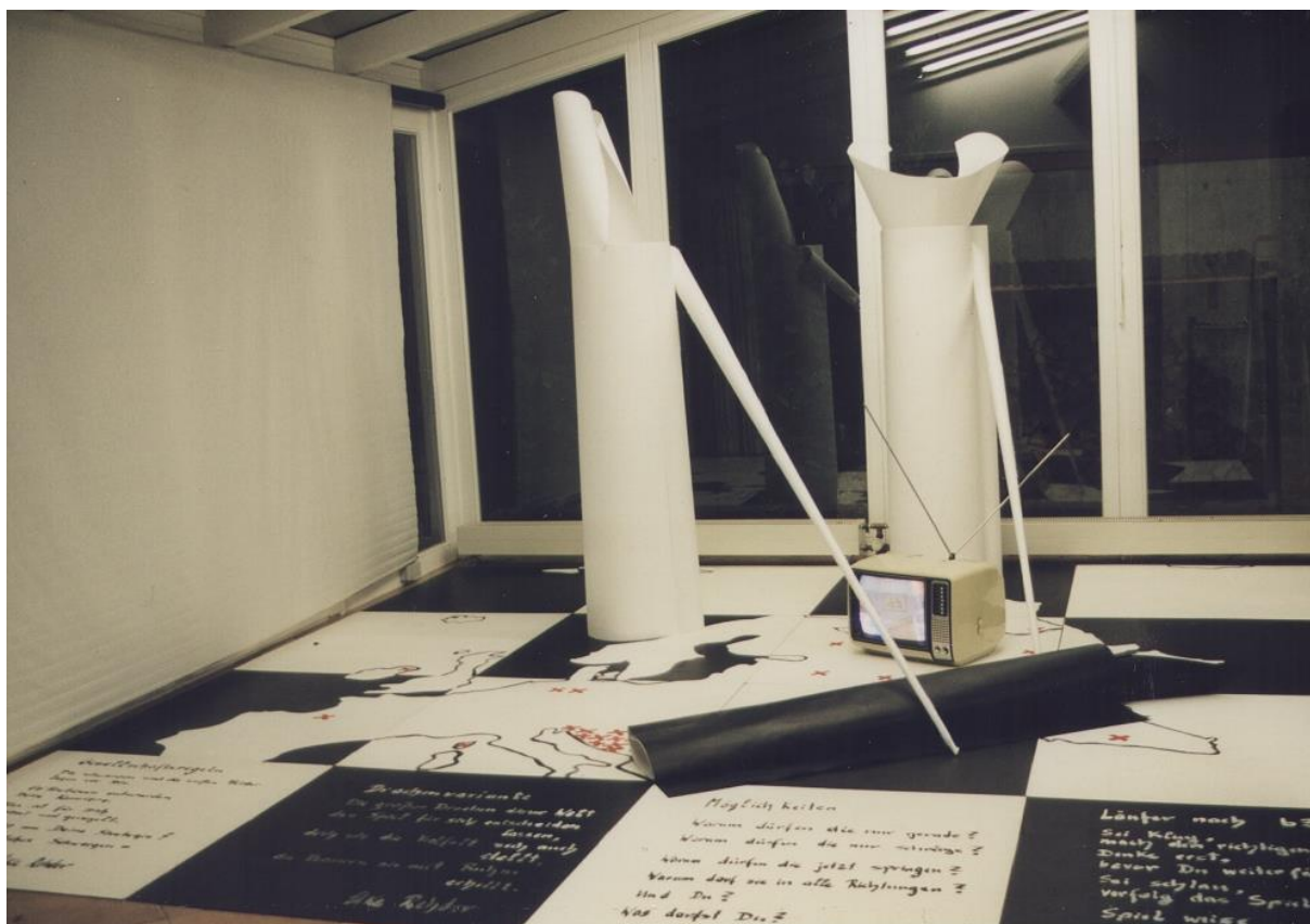
"The Whites always begin" - Installation 1996. A political-subtle work by Elke Rehder. Size 4 x 4 x 2 meters. Material: cardboard, hardboard and acrylic paint.