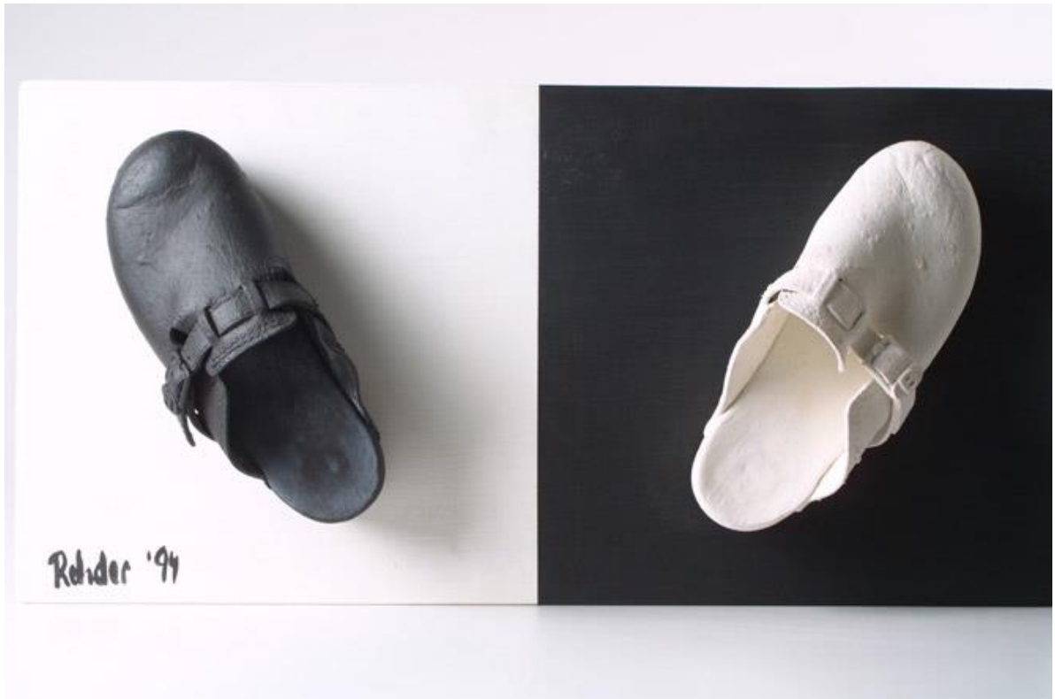
Chess Shoes 1994 in the city of Ghent and now in the Museum SONS in Kruishoutem in Belgium.