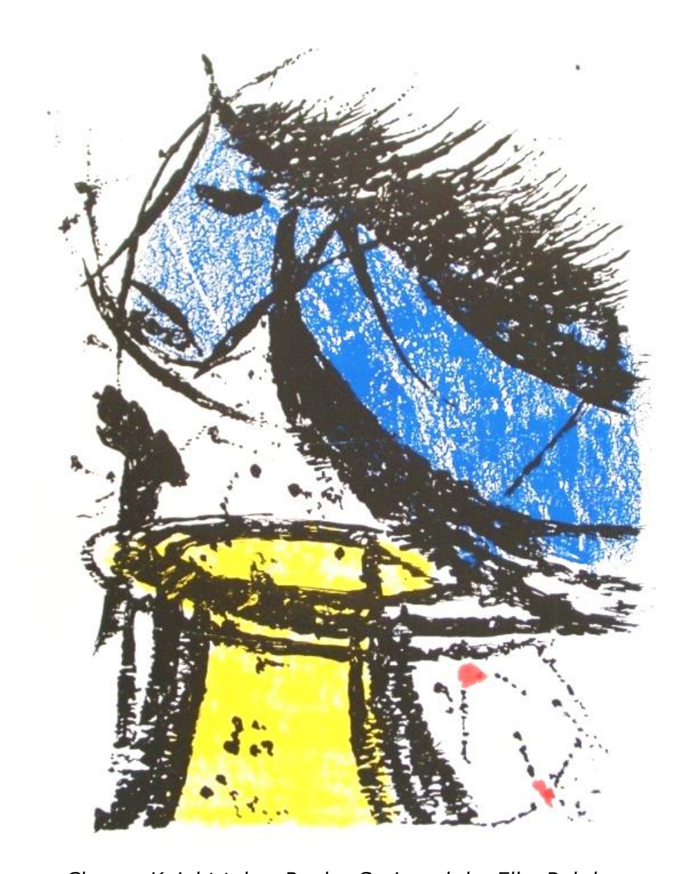
Chess - Knight takes Rook - Serigraph by Elke Rehder