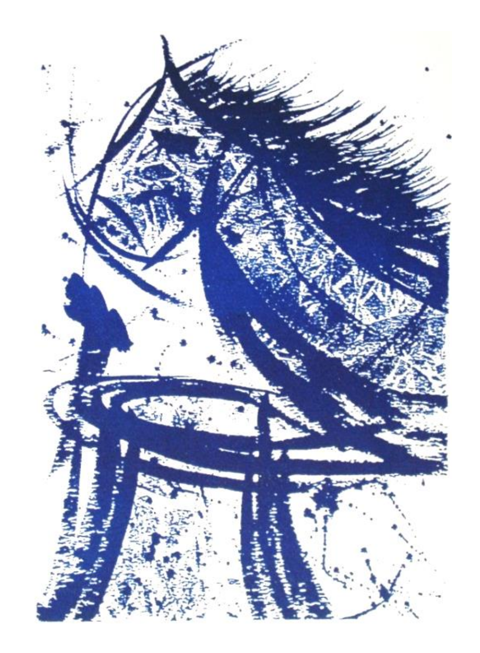
Chess - Knight takes Rook - variant in dark blue by Elke Rehder