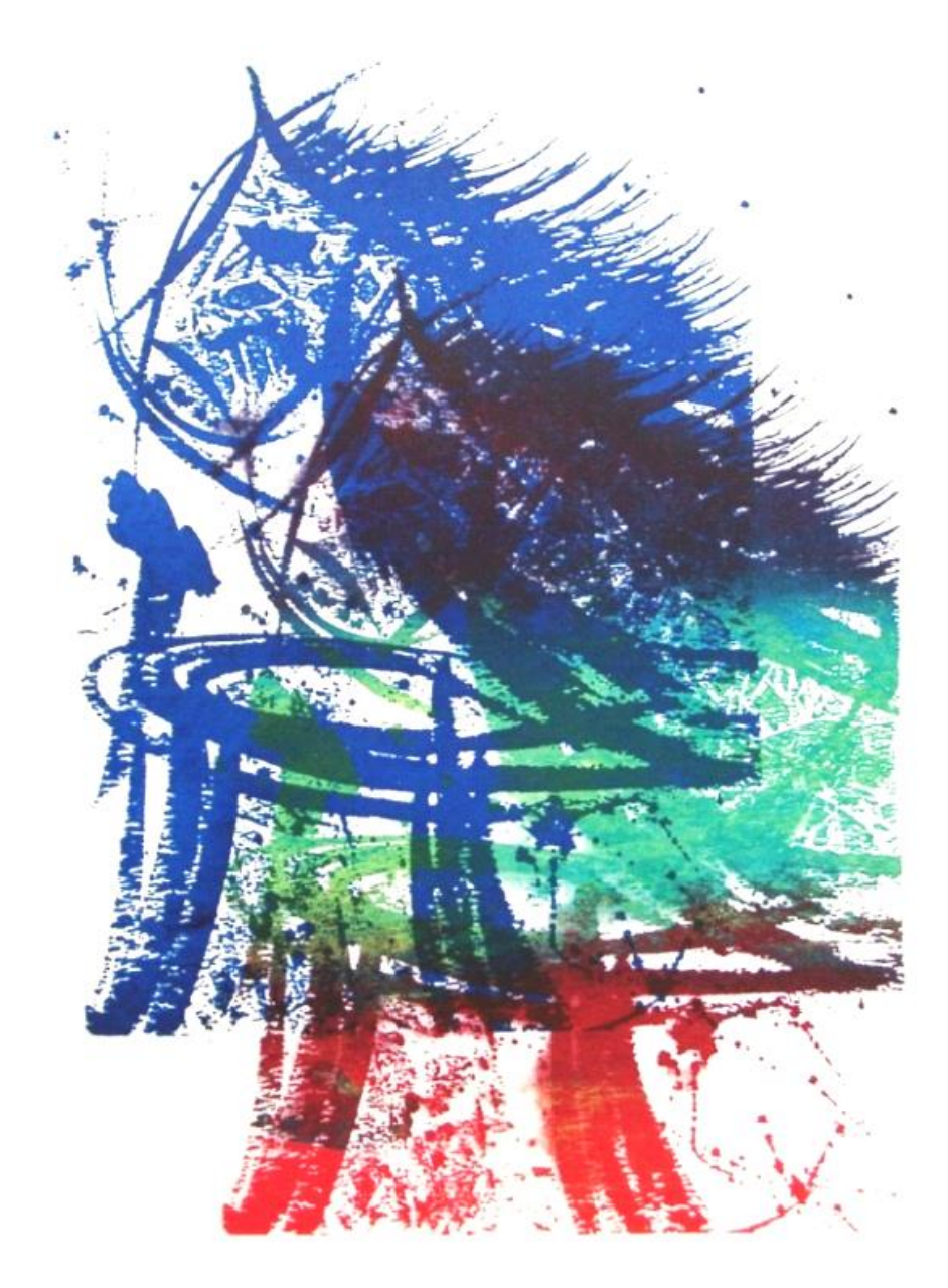
Chess - Knight takes Rook - Serigraph in variation blue, green, red by Elke Rehder