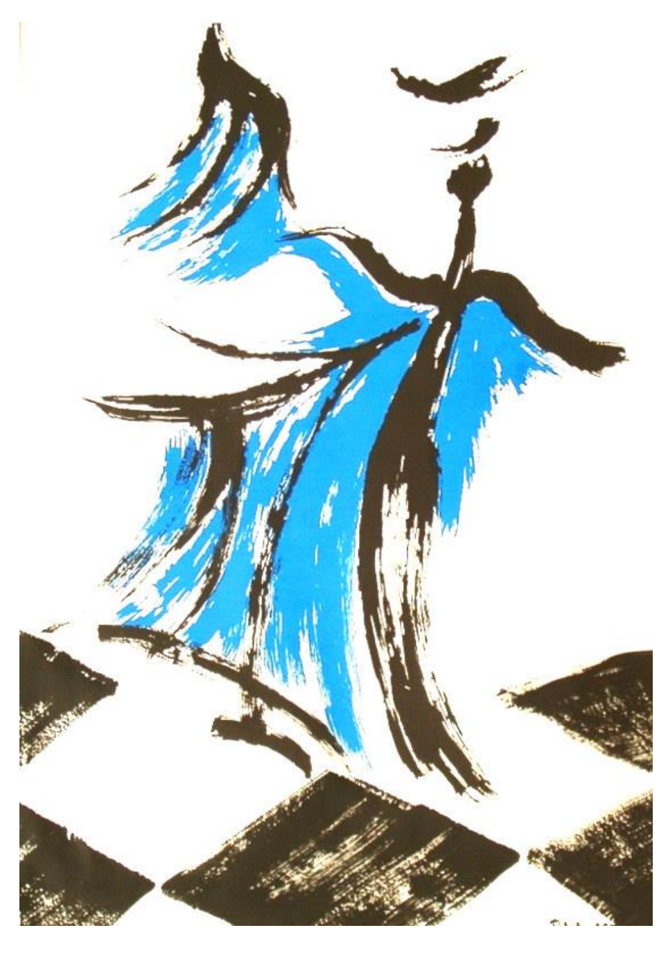
Blue Dancer Chess - Serigraph with acrylic paint by Elke Rehder

Elke Rehder used this printing technique from 1990 to 1999 for her colorful large posters like "Blue Dancer Chess" or the chess prints "Knight takes Rook"