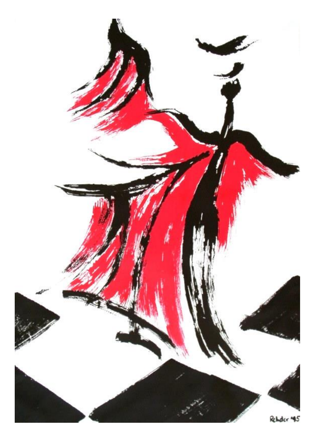
Red Dancer Chess - Serigraph with acrylic paint by Elke Rehder