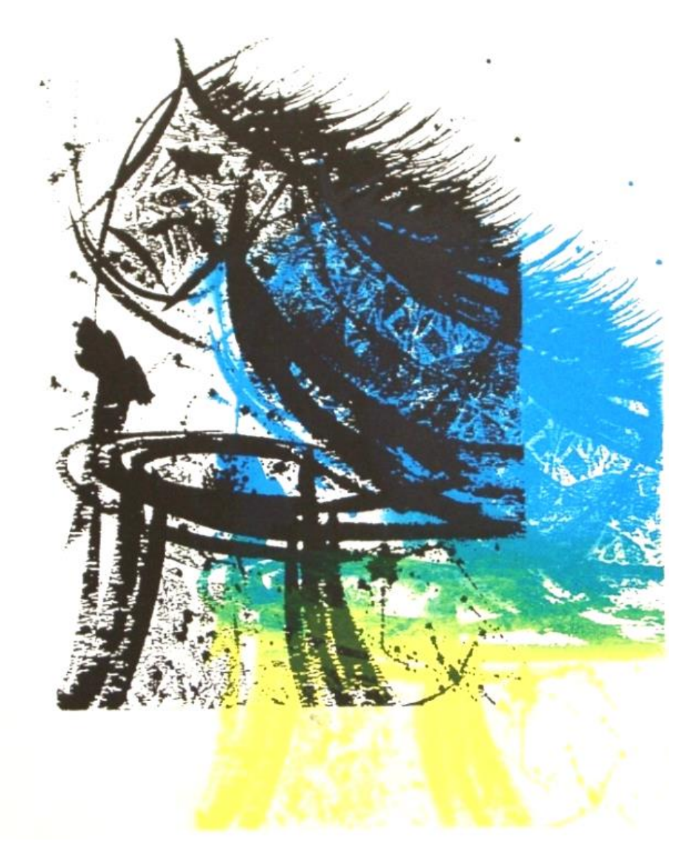
Chess - Knight takes Rook - Serigraph in variation blue, black, yellow by Elke Rehder