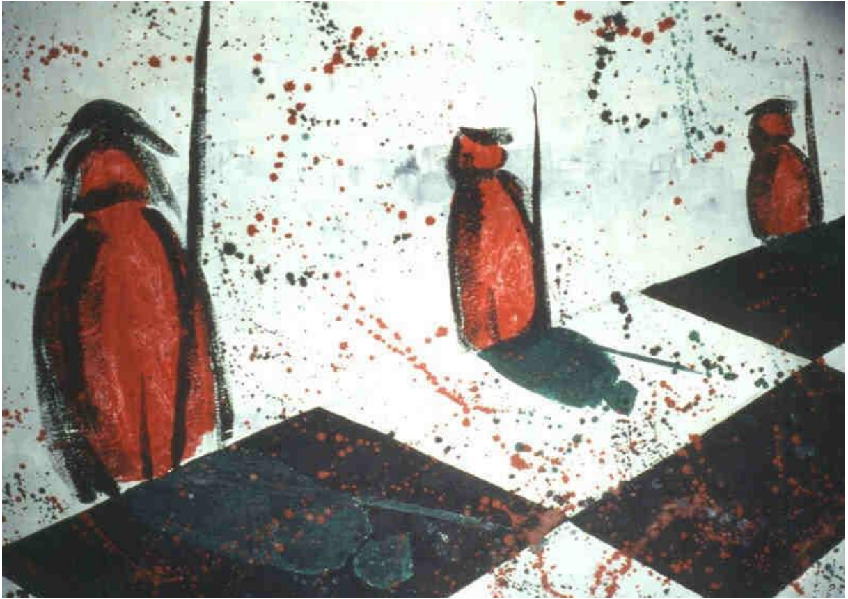
Front of Pawns