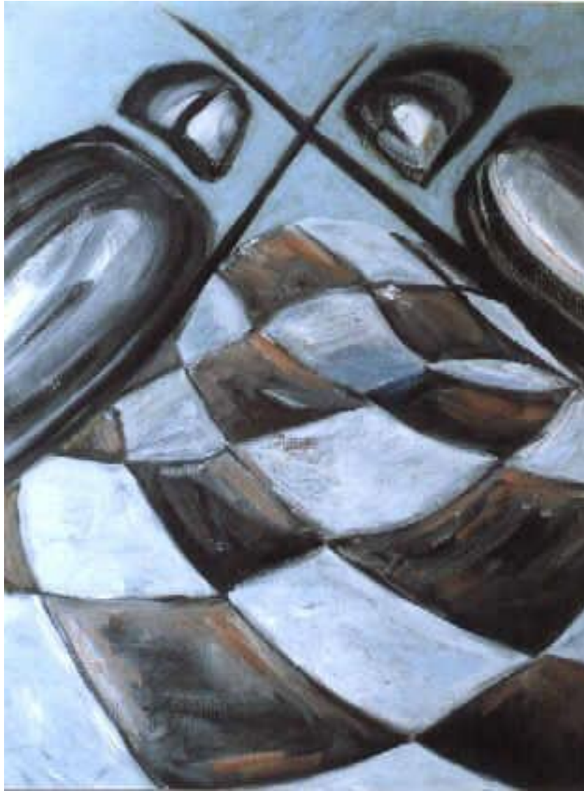
Chess - Fight