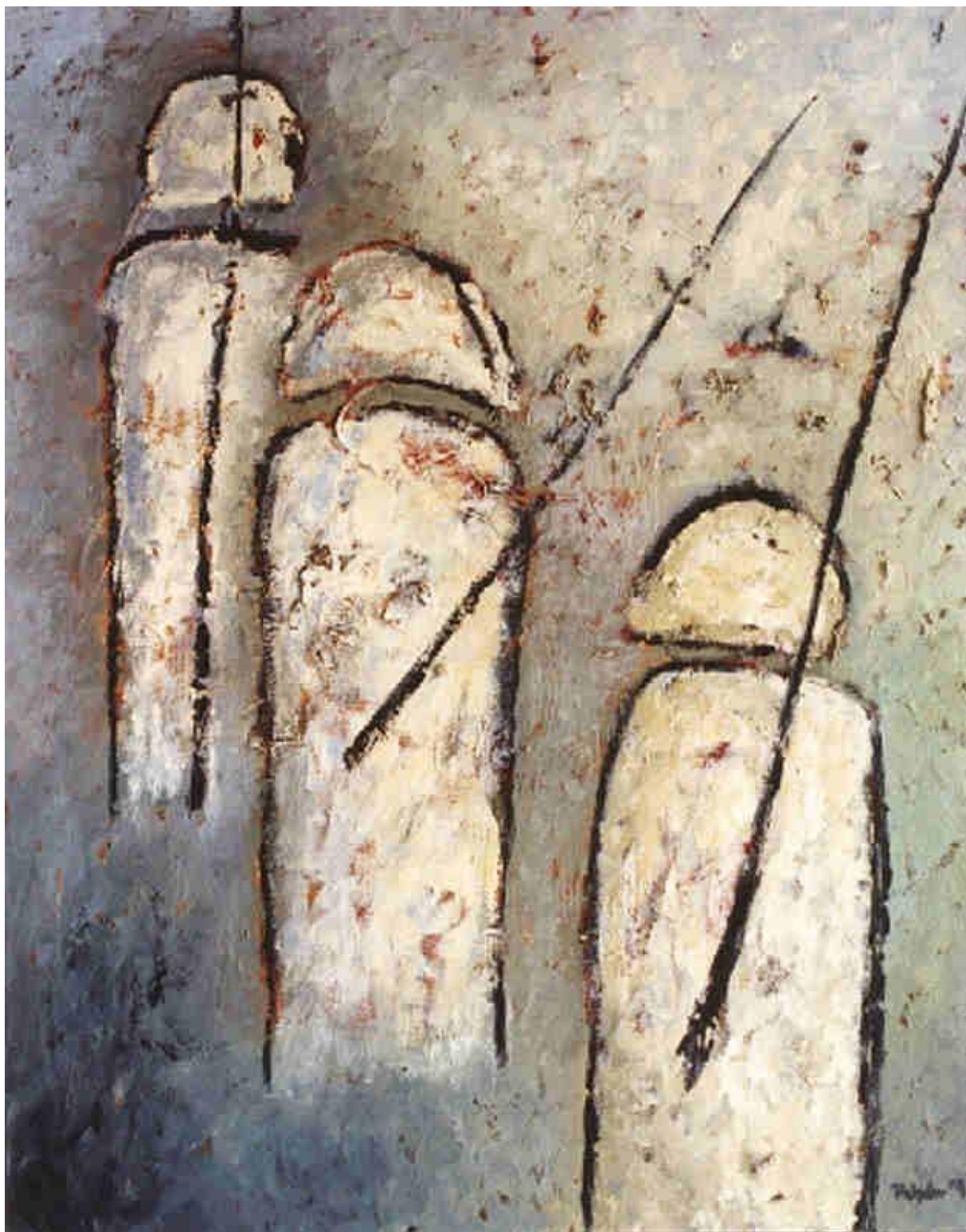
Concentration of the Pawns