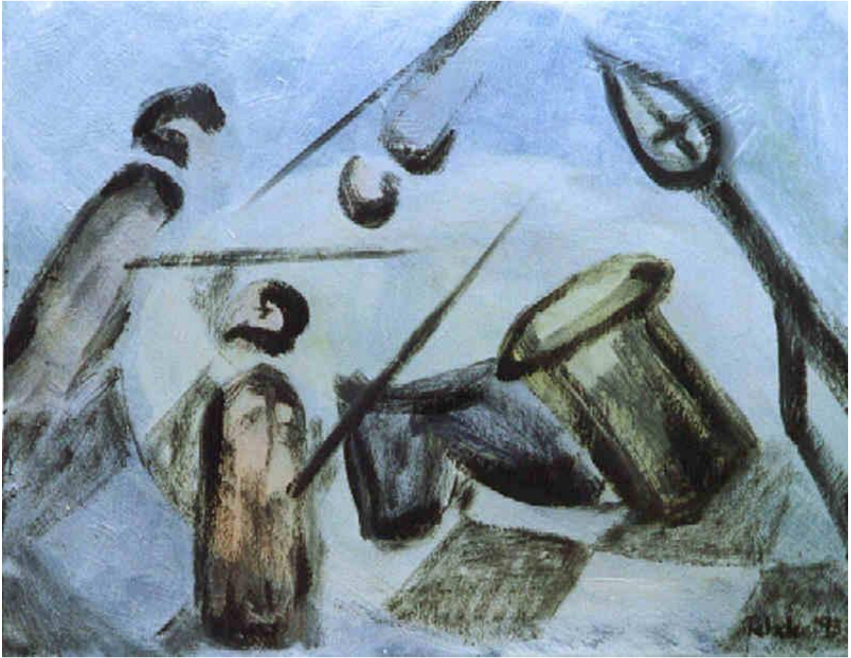
A clever Trap