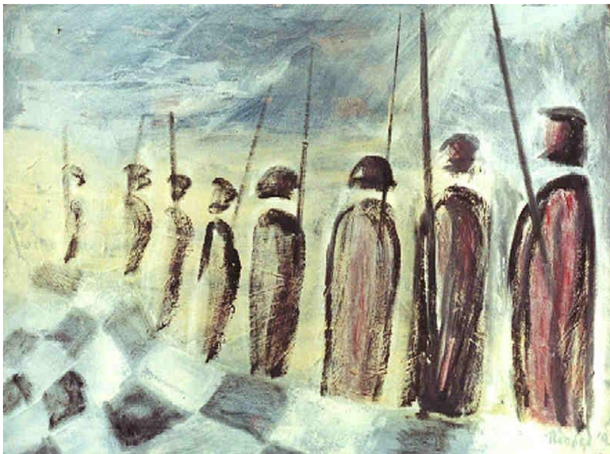
Chain of Pawns