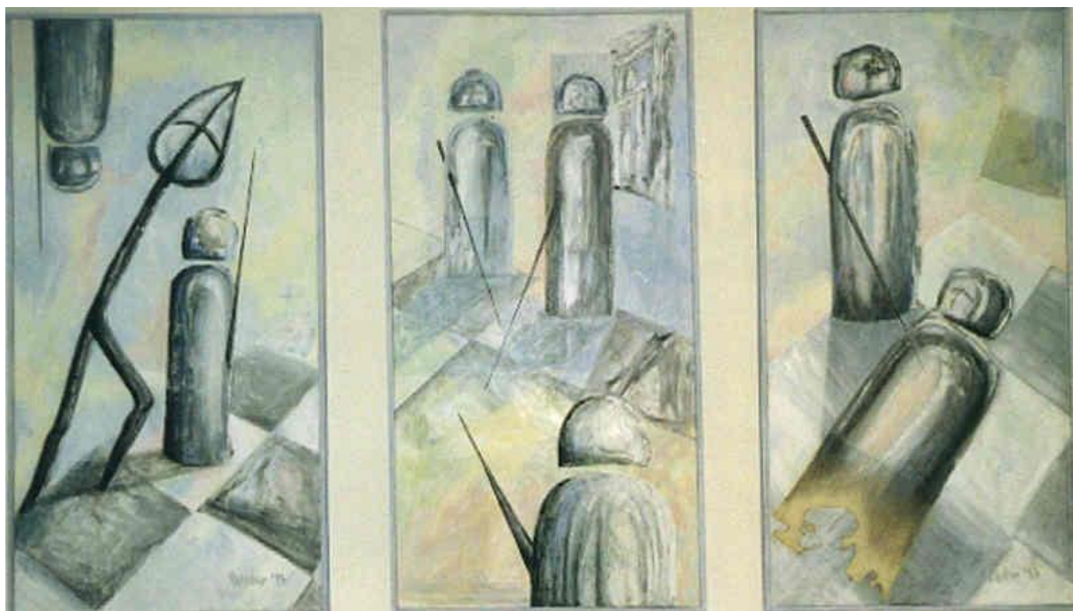
Big Trilogy 2 x 3 m