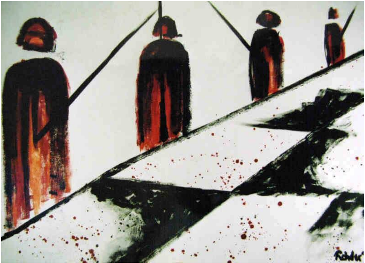
Front of Pawns in Wolfenbüttel