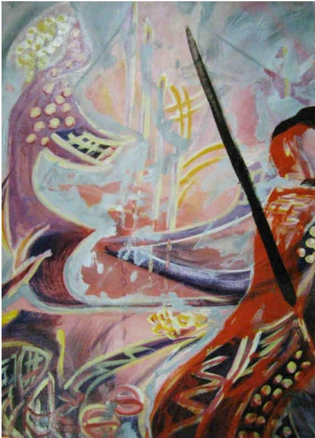
Knight and Pawn