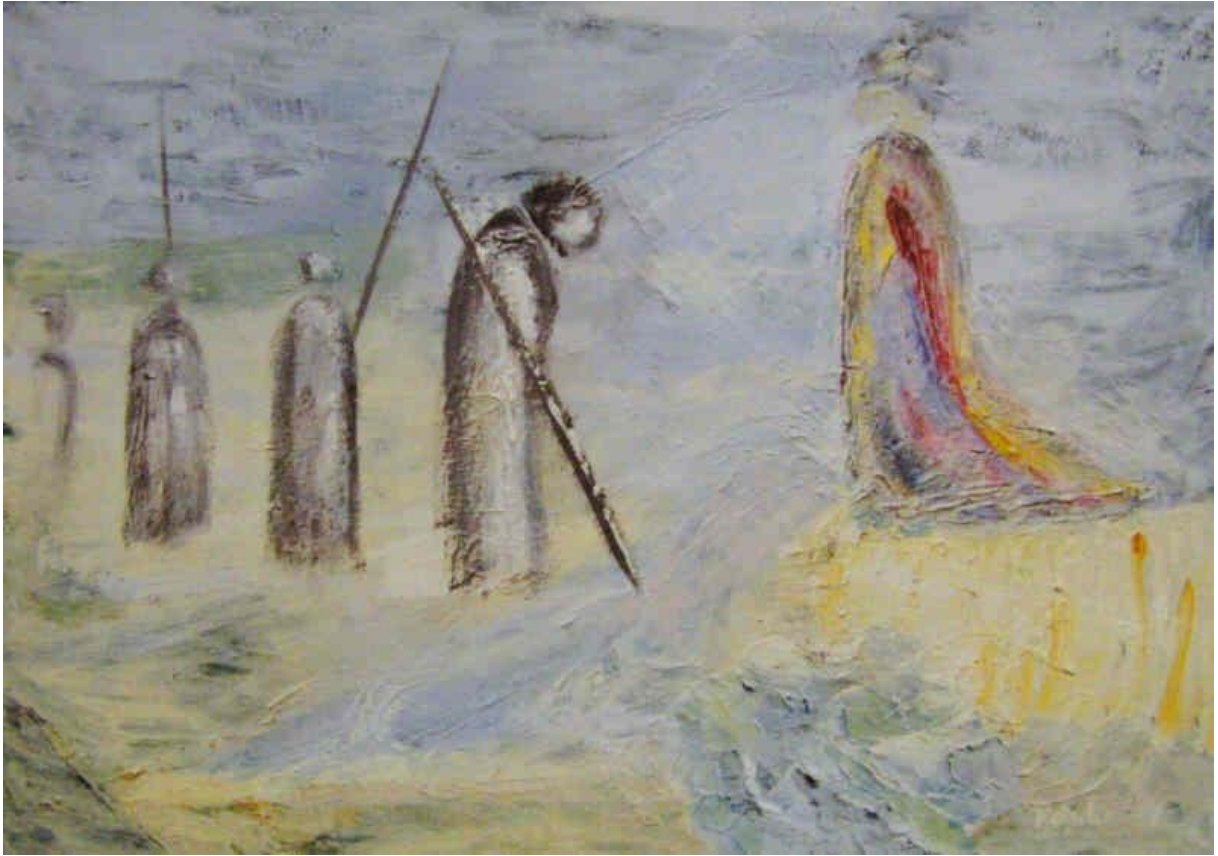
Pawns appear before the King