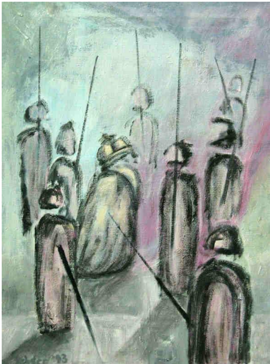
Pawns threaten the King