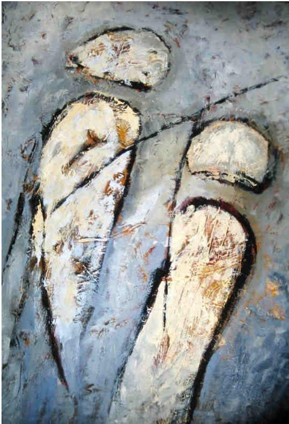
The Battle II