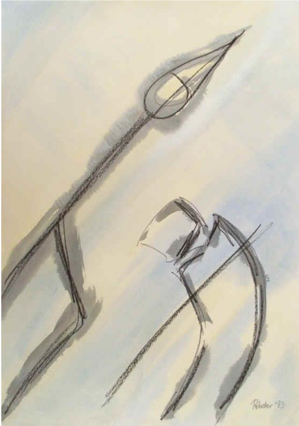
A useless move 1