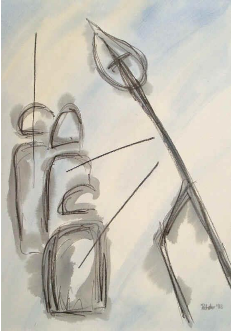
Bishop move forward 1