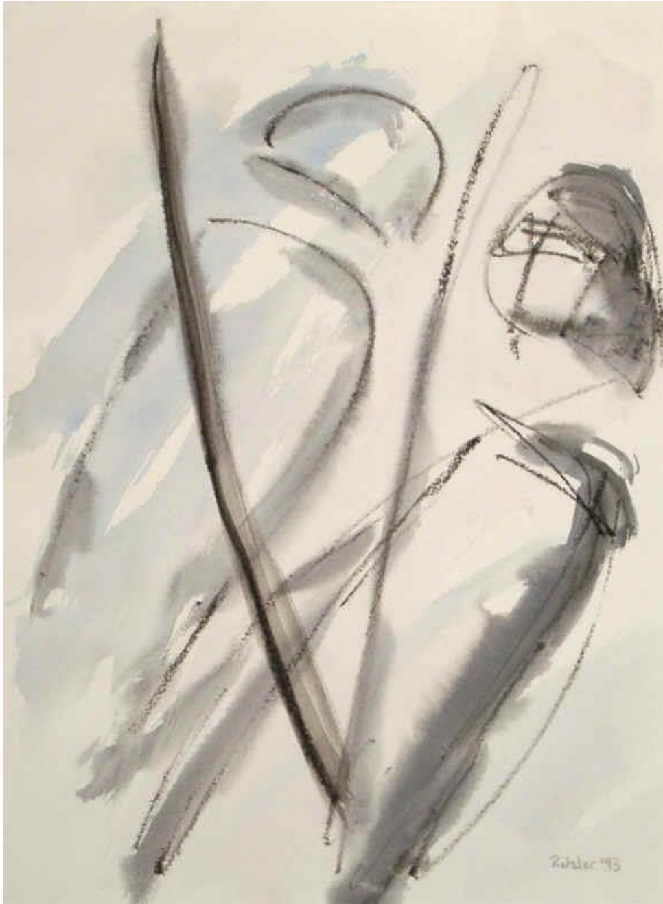
The Fight 1

Charcoal drawings mixed with watercolors by the German artist Elke Rehder.