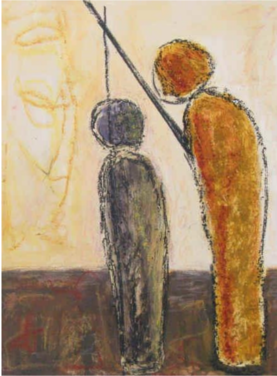
Two Pawns material painting