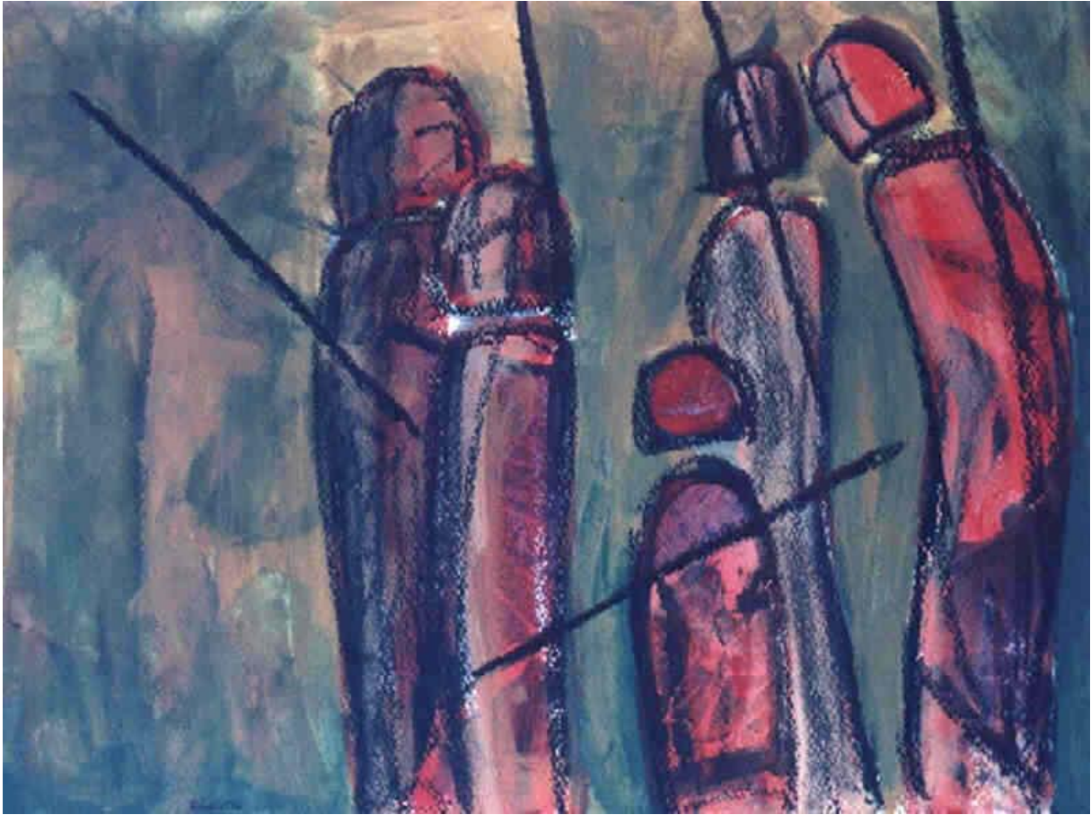
Defense of the Pawns