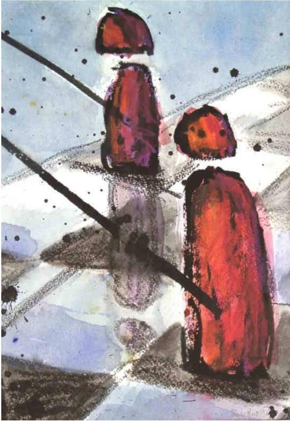
Two Pawns untitled