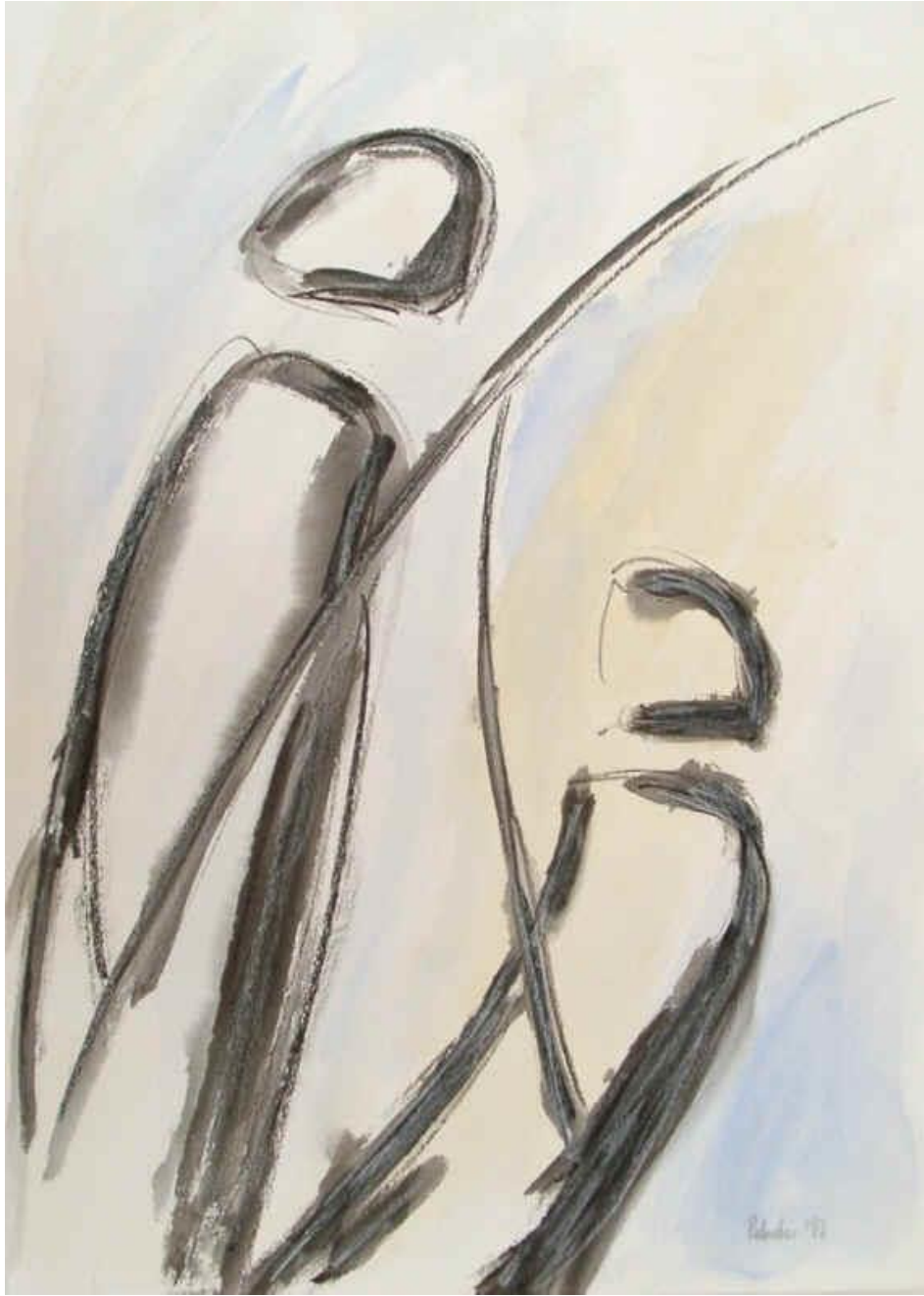
The Fight 2a