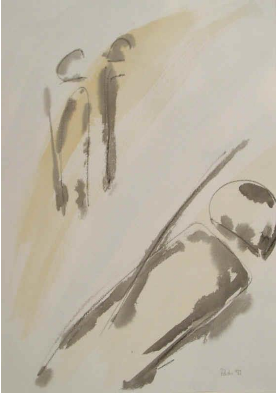
A wrong move