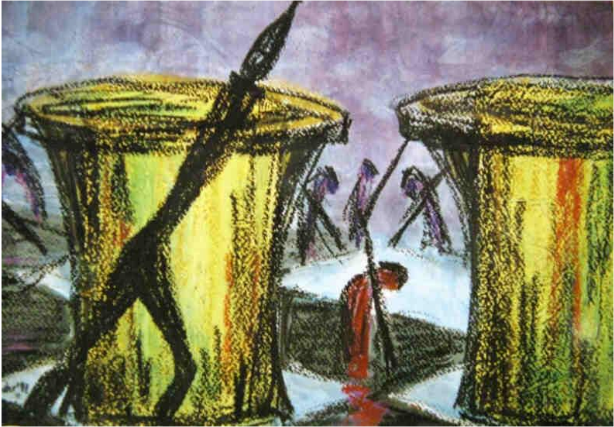
The Rooks dominate