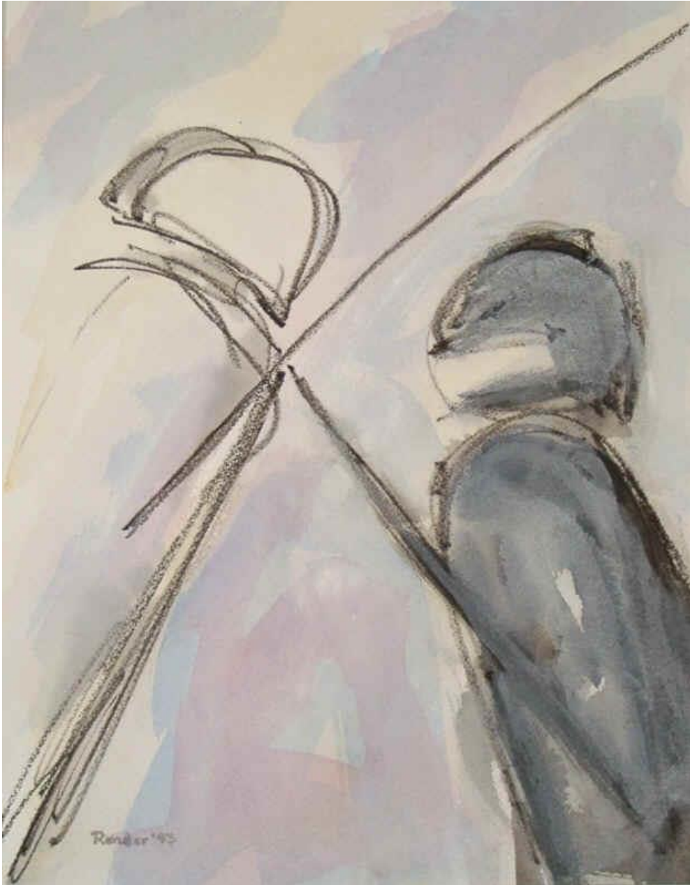
The Fight 3